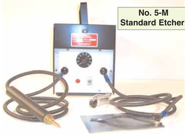
No. 5-M Standard Etcher

For Catalog Numbers, etc., see next page.